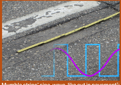
Mumble strips' sine-wave-like cut in pavement<sup>7</sup>; overlay shows profile of rumble strips (blue line) versus mumble strips (purple line).<sup>4</sup>

strips' effects on crash reduction because current research focuses on noise levels rather than effectiveness.<sup>4,5</sup> Regardless, the WSU group concluded that the noise levels produced by cars contacting standard rumble strips were no greater than that of "tractortrailer trucks traveling on normal highways."<sup>6</sup>