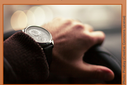
Visit <u>http://drowsydriving.org/</u> for more information about drowsy driving and visit <u>http://www.nhlbi.nih.</u> <u>gov/health/health-topics/topics/sdd/why</u> to learn more about healthy sleep.

In a 1990 study published by the NIH, researchers found that caffeine did improve alertness when compared to a placebo. However, caffeine will decrease memory performance, making a person more prone to mistakes (WebMD).