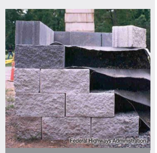
A cross section of a GRS-IBS abutment. The outward-facing brick is a non-structural veneer that protects the inner material.

There are plans to use the Ionia County GRS-IBS project as a learning event by holding an open house during the final stages of abutment construction, jointly hosted by MDOT and Ionia County. The open house will present the details of the project and lessons learned during design and construction, and will discuss the future of GRS-IBS in Michigan. The open house is expected to take place in late July 2014 and will be advertised on the Center for Technology & Training events page.